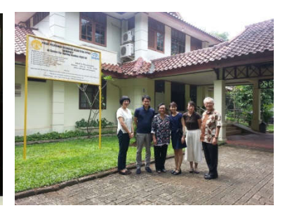
B. Entry Level Training (October 31 – November 1, 2016)