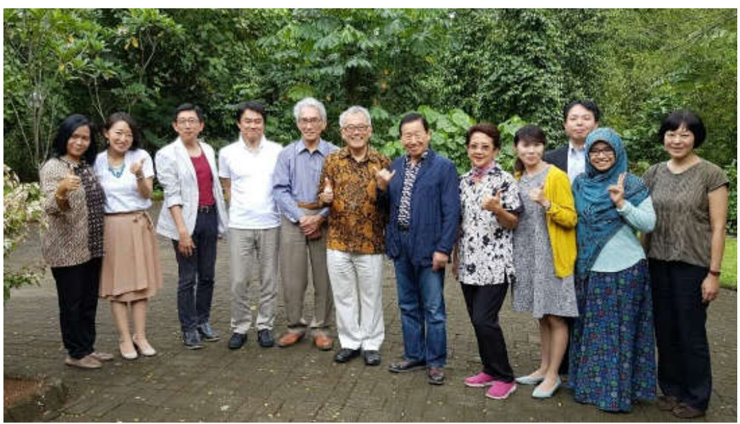
~ THANK YOU ~